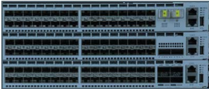
Arista 7280E Flexible Port Combinations

The 7280E delivers unprecedented levels of buffering, scale, and availability with high-density 10GbE interfaces and a choice of uplink interfaces as shown on the right from top to bottom: