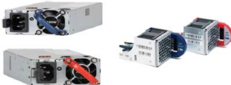
Hot swap and reversible power supply and fan modules