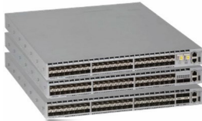
Arista 7280E family

All models in the 7280E series deliver rich layer 2 and layer 3 features with wire speed performance up to 1.44 Terabits per second. The Arista 7280E series offers a virtual output queue architecture combined with an ultra-deep 9 GB of packet buffers that eliminates head of line blocking and allows for lossless forwarding under sustained congestion and the most demanding application loads. Combined with Arista EOS the 7280E series delivers advanced features for HPC, big data, content delivery, cloud, and virtualized environments.